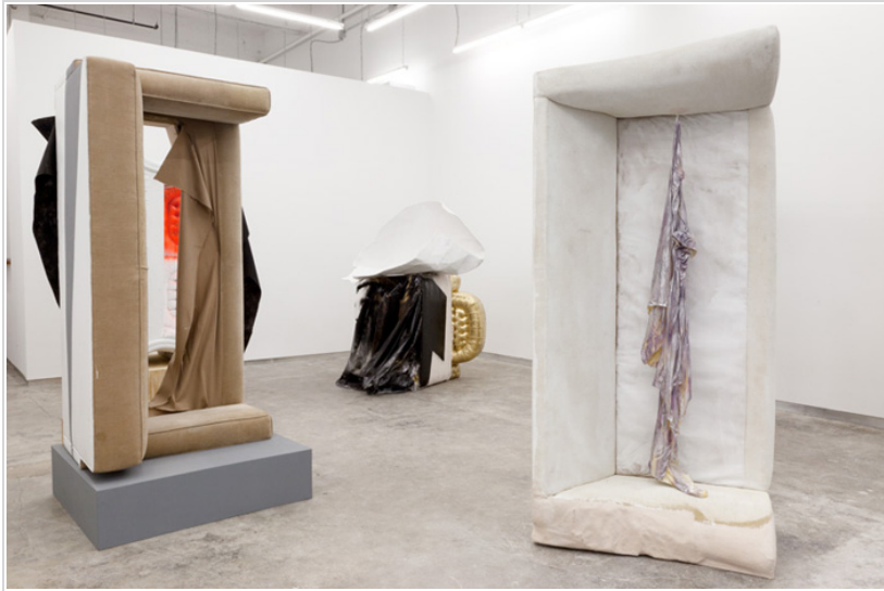
ERNESTO BURGOS, INSTALLATION VIEW, IMAGE COURTESY OF KATE WERBLE GALLERY, NEW YORK.

Ernesto Burgos' solo show at Kate Werble Gallery , titled the tone was a synthesis of all the voices they had ever heard , consists primarily of a group of vintage couches that have been upended and reworked into remarkably varied sculptural objects. Gutted and reconstituted with a deft oscillation between crafted wood and blunt, happenstance materials, the couches resonate as both objects and conceptual confrontations against history and material culture. Each piece also houses the specter of the couch's implied human occupant, which seemingly has been enfolded into the structure's fabric like a lost t-shirt, reverberating as a tsunami of abstraction. Quizzical and daring, Burgos' work occupies a tensely coiled line between the temporal fact of the everyday and timeless potentiality.